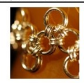
Feb - Japanese bracelet (EC gold) Kit = will have Gold toned Enameled Copper rings and clasp.