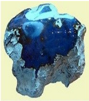
Blue amber from the Dominican Republic

Amber has a heterogeneous (nonuniform) composition consisting of plant resins associated with bituminous (sticky, black, and highly viscous liquids or semi-solid forms of petroleum) substances. Most amber has a Mohs hardness between 2.0 and 2.5 making it about as soft as gypsum but not as hard as calcite. Amber has a specific gravity between 1.06 and 1.10 and a melting point of 482–572 °F. It occurs in a variety of colors. In addition to the usual yellow-orange-brown that we associate with the color “amber”, the stone can range from a whitish color to a pale lemon yellow, to brown and almost black. Other uncommon colors include red amber (sometimes called "cherry amber"), green amber, and the rare and highly sought after blue amber of the Dominican Republic.