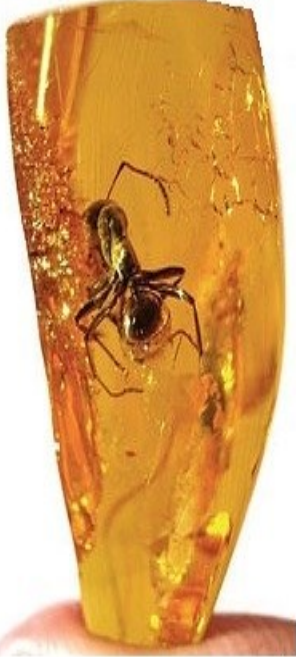
An ant trapped inside Baltic amber

This article was inspired by the traditional Christian story of the nativity. Two of the gifts that the Magi (also known as the “Three Kings” and the “Three Wise Men”) gave the infant Jesus were frankincense and myrrh. Frankincense is an aromatic resin harvested from five species of Boswellia tree. Frankincense is used in perfume, in aromatherapy (a pseudoscience based on aromatic materials), and in medicine (for its anti-bacterial properties). Myrrh is an aromatic resin harvested from a small, thorny species of Commiphora tree. Like frankincense, myrrh is used as perfume, incense, and medicine.