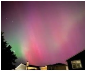
Aurora borealis over Meridianville, AL.

This month's mineral was inspired by the colorful lights recently visible in North Alabama night skies. The aurora borealis (also known as the northern lights ) is a natural light display resulting from disturbances in the Earth's magnetosphere , the region of space surrounding Earth in which charged particles are affected by Earth's magnetic field. The Sun released powerful streams of charged particles (solar wind) that disrupted Earth's magnetosphere several times this year. On at least two of those occasions, the resulting lights were visible as far south as North Alabama.