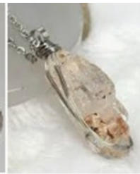
Skeleton quartz pendant