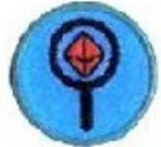
Rocks & Minerals