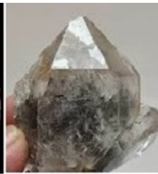
Skeleton quartz w/black phantom