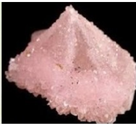
Rose skeleton quartz w/secondary drusy