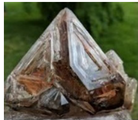
Smoky skeleton quartz

References: mindat.org , Rock and Gem magazine, October 16, 2023. See also mcrocks.com/images/DiamondHillGeology.html for more information on the Diamond Hill Quartz Mine.