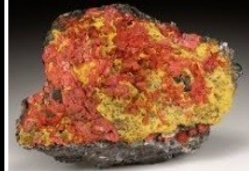
Yellow orange orpiment with orange red realgar.