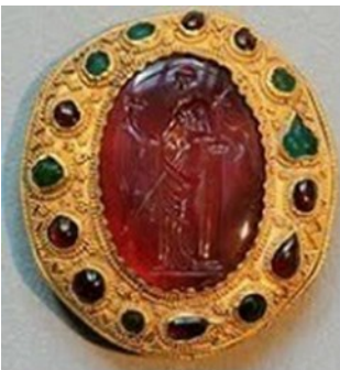
Carnelian intaglio broche

Carnelian has been used as a semiprecious gemstone since antiquity. The red variety was used as beads in the Early Neolithic period. Early Greeks used carnelian in broches and rings. Today, carnelian is still a favorite gemstone for jewelry making. For example, it's cut, formed, and polished into cabochons, beads, and rings, and carved into cameos, animal figures, and ornamental objects.