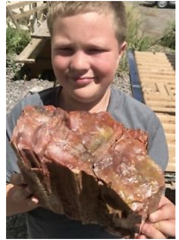
Pebble Pups Location